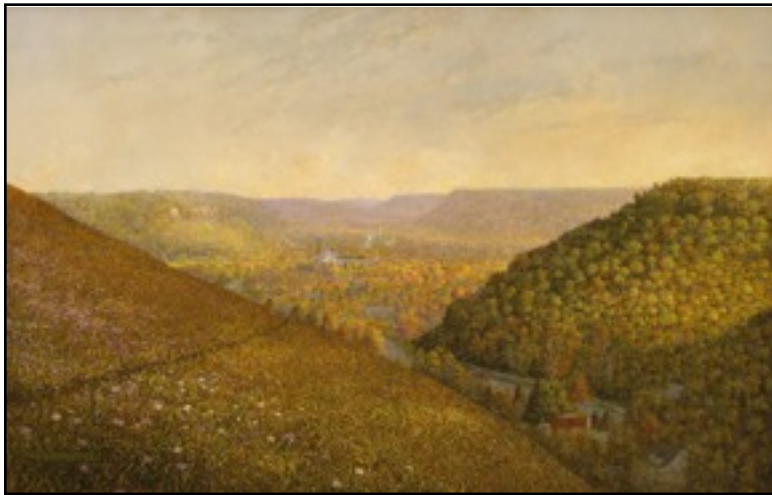
"View from Barn Bluff" by Len Guggenberger.

"View from Barn Bluff" by Len Guggenberger has been juried into the 56th Annual Exhibition of the National Society of Painters in Casein and Acrylic and was awarded the Shiva Award for Casein Painting at the historic and prestigious Salmagundi Club in New York, NY. The Shiva Award is one of the top four awards given the juried artwork. This painting is a fine example of realistic-impressionism and has earned Guggenberger national acclaim once more.