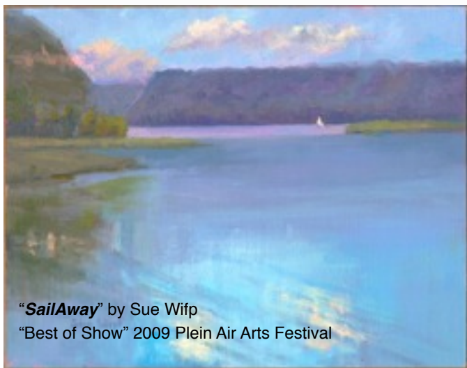
“SailAway” by Sue Wifp “Best of Show” 2009 Plein Air Arts Festival

Public Reception: June 26, 5:00 - 7:00 PM