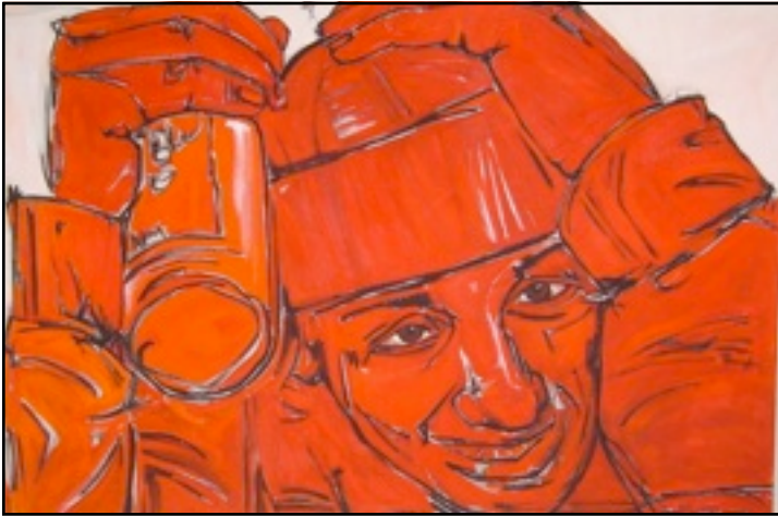
“Beer” 36” x 54” Acrylic Paint Photo submitted

Display Dates: May 7 - June 23, 2010 Public Reception: May 8, 5:00 – 7:00 PM