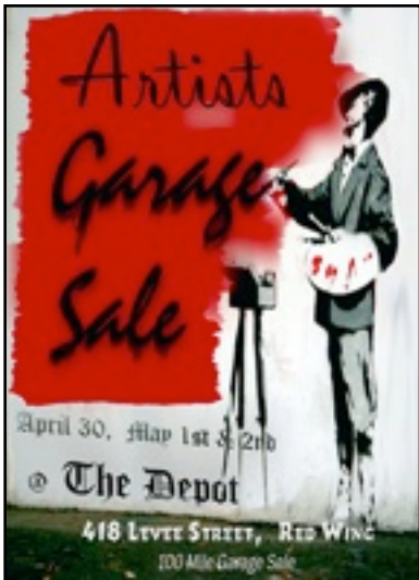
Poster by Ted Horn

You may have heard about our recent close call with flood waters from the Mississippi? This necessitated a quick clean up of our storage areas and made us realize we needed to hold a garage sale.