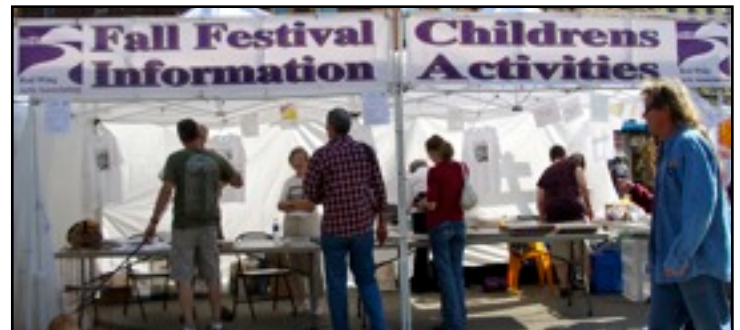
New Fall Festival RWAA Booth Banners.

Red Wing is a wonderful community of businesses and organizations working together-more importantly, we are a community of supportive friends, neighbors and artists.