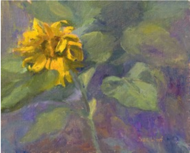
“Sunflower Going Solo” by Sue Wipf