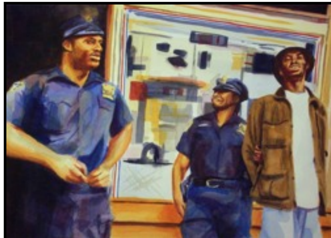
Busted in China Town by Dustin Young

Display Dates: April 9 - May 2, 2010 Public Reception: April 10, 6:00-8:00 PM